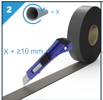
Measure the circumference of the service penetration and cut the Multiwrap to size with a knife. Remember to keep an extra length of at least 10 mm to create an overlap.