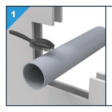
Make sure that the service penetration and the gap are free from dust, dirt and grease.