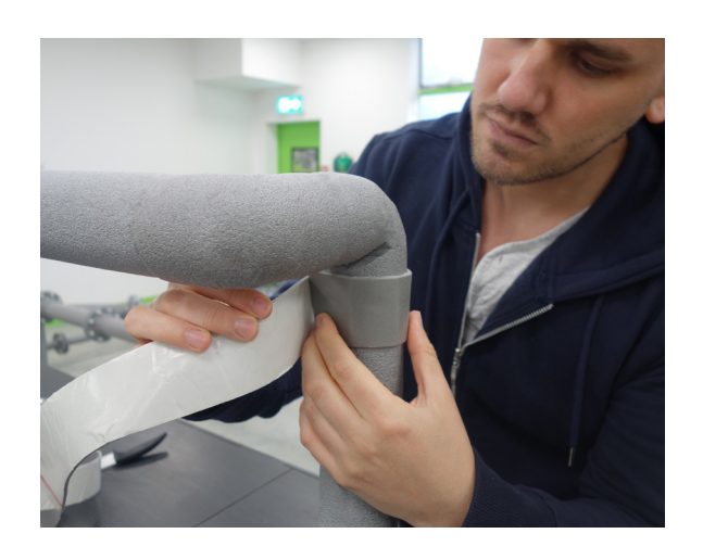
STEP 5 If required use Tubolit tape or clips to secure any joins.

DONE! a neat and easy installation with Tubolit Quick